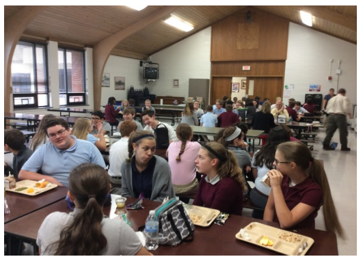
Jr. High Students Eating with Their Mentor Partner.

develop their leadership skills, and spend even more time together.