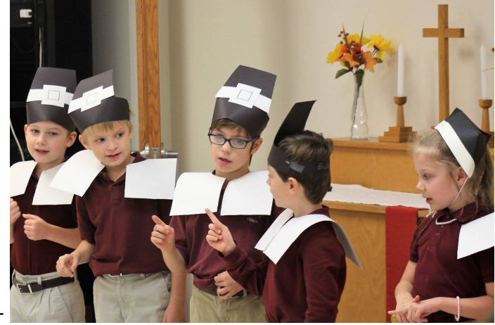
First Grade Students Performing for Their Guests

their parts, and all they needed then was their costumes."