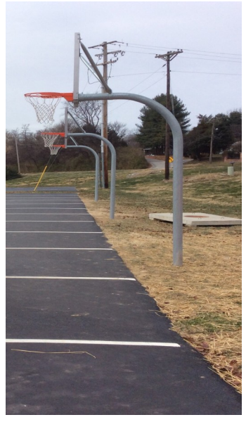
Basketball Hoops Purchased with Last Year's Auction Donations

students to have many privileges that other schools don't have.