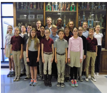
2017 Junior Track Team

If you are interested in joining the Good Shepherd track team, it's not too late to sign up! Join now and see what you can accomplish if you work hard and have fun!