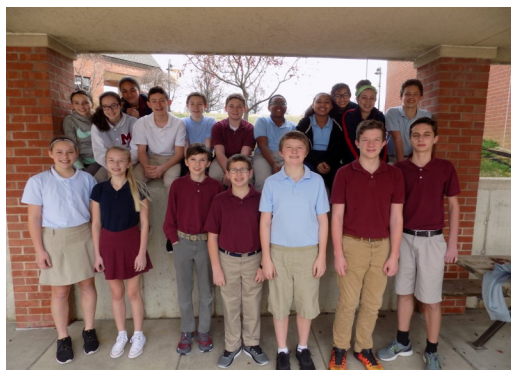
2017 Senior Track Team

loved it." He also said, "I started to coach because I love track and love teaching kids how to do it."