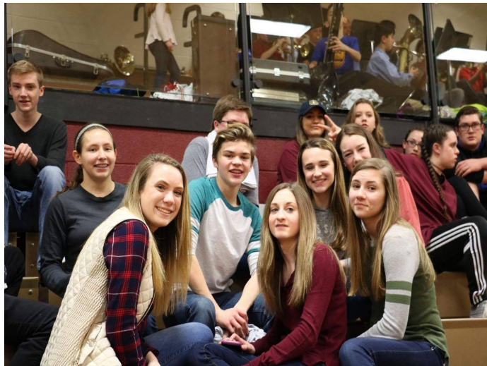
Alumni Enjoying the Game and Reuniting with Friends