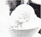
204 Vanilla Ice Cream