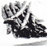
781 Asparagus Spears