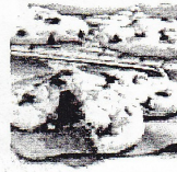
644 Chocolate Chip Frozen Cookie Dough