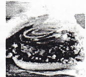
458 Black Angus Burgers