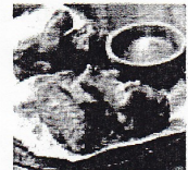
414 Oven Roasted Chicken Wings with BBQ Dry Rub Seasoning