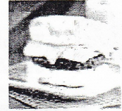
898 Sausage, Egg & Cheese Breakfast Sandwich