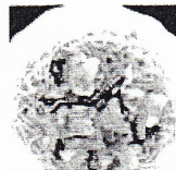
450 Chicken Lo Mein Skillet Meal