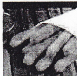
518 Chicken Fries