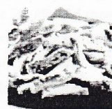
496 Fire Grilled Chicken Breast Strips