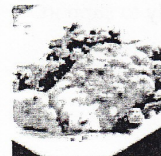
503 Ancient Grain Encrusted Cod