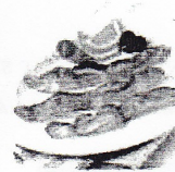
811 Fully Cooked Bacon Slices