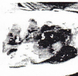
502 Unbreaded Chicken Breast

Call 1-855-870-7208 and provide Campaign ID: 34014 and Team Member ID, if applicable.