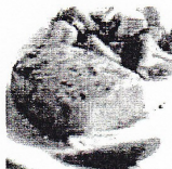
393 Boneless Pork Loin Chops