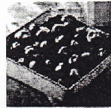
804 Whole Blueberries "All Natural"