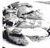
404 Oven Baked Chicken Breast