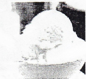
204 Vanilla Ice Cream