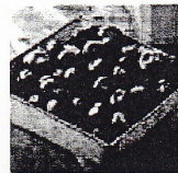
804 Whole Blueberries "All Natural"