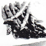
781 Asparagus Spears