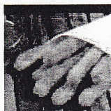
518 Chicken Fries