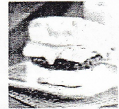
898 Sausage, Egg & Cheese Breakfast Sandwich