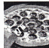
603 Pizzeria Pepperoni Pizza