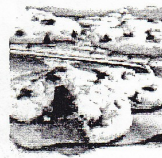
644 Chocolate Chip Frozen Cookie Dough