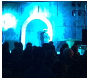
Martin Luther Hammering the 95 Theses to the Church Door

been working on it) definitely since January, probably before then".