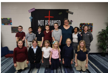
4th Grade - Batty