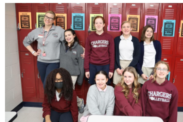
7th Grade- Girls