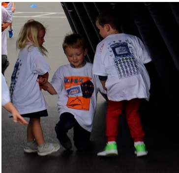
Help one another up!

This is why we do what we do here at GSLCS: teach students to "LOVE one another." It was great at the APEX Fun Run to see especially our Pre K students helping each other up when they fell down, modeling Ecclesiastes 4:10 "If either of them falls down, one can help the other up" and also cheering each other on to finish the 36 laps and living out Hebrews 10:24 "And let us consider how we may spur one another on toward love and good deeds." GO, Chargers!!!