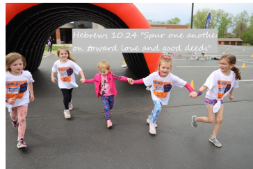
Spur one another on!!!