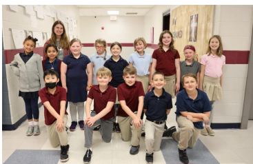
3rd Grade - Gain