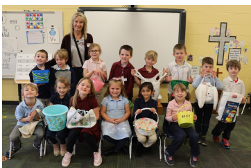
Kindergarten - Krause