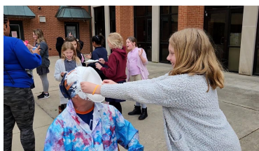
Pie in the Face