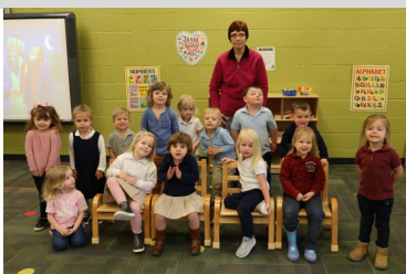
Pre K-3 - Hill