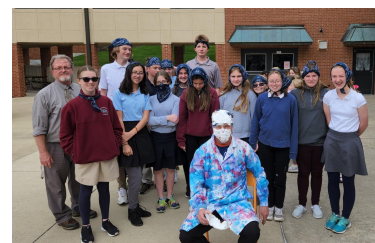
8th Grade Winners!!!

We raised over $27,000 with the Fun Run for the school! WAY TO GO CHARGERS!