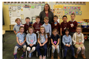
Kindergarten - Sengele

Click here to watch the Early Childhood Easter Party Video: Easter Video for Early Childhood