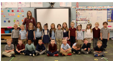
Pre K-4 - Nobbe